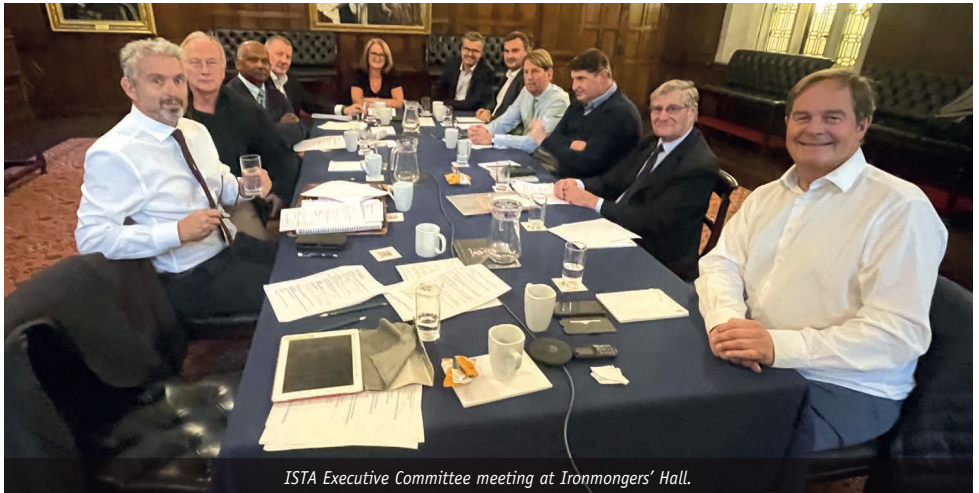
ISTA Executive Committee meeting at Ironmongers' Hall.