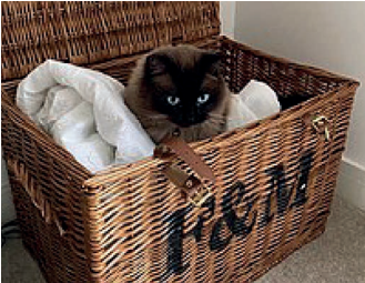
Chairman's 2022 charity raffle prize winner's hamper has been recycled!