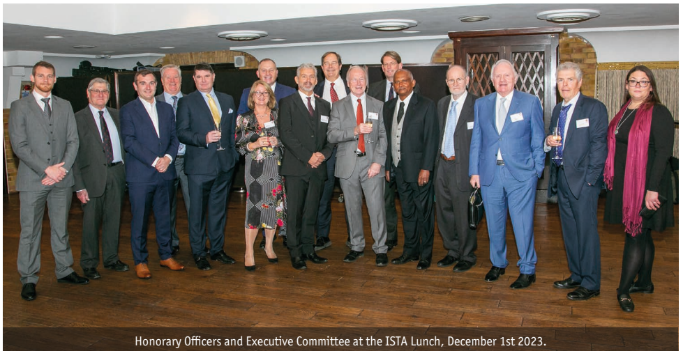
Honorary Officers and Executive Committee at the ISTA Lunch, December 1st 2023.