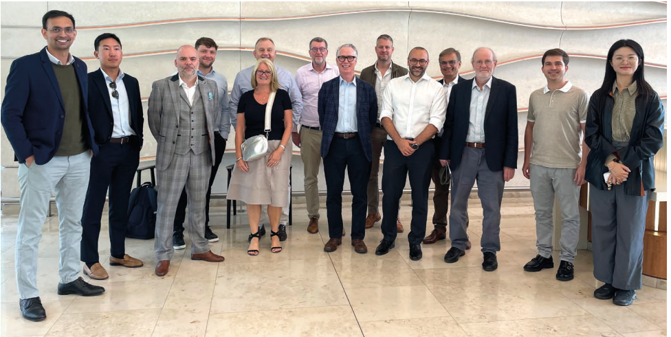
ISTA members visit the LME, 2nd May 2024.